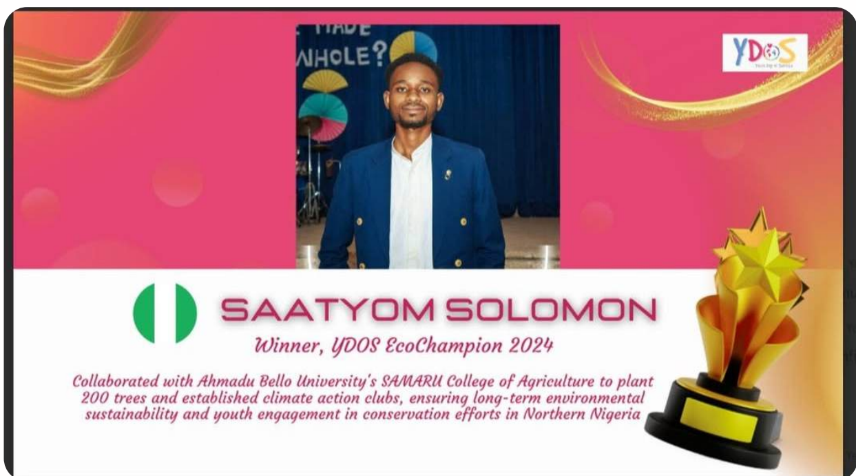
YDOS 2024 EcoChampion Award Winner - from Nigeria