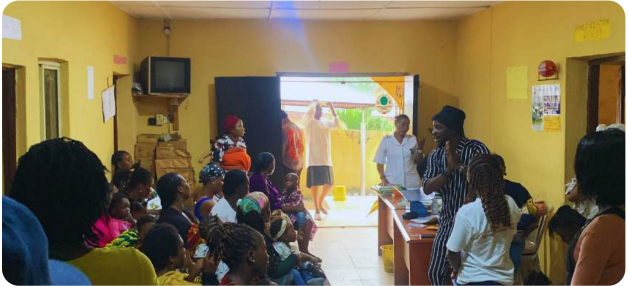
LEAP Africa Team during Monitoring Visit to Obawole PHC, Lagos, Nigeria in October 2024

The evaluation methodology was based on the Organization for Economic Co-operation and Development (OECD) Development Assistance Committee (DAC) criteria for evaluation, which assess programs across six key dimensions: relevance, coherence, effectiveness, efficiency, impact, and sustainability. These criteria provided a structured framework for evaluating the YDOS Programme in terms of its performance and outcomes.