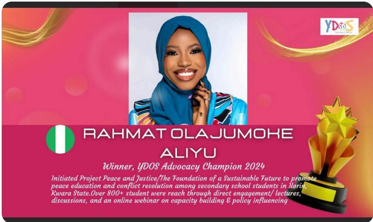
YDOS 2024 Advocacy Award Winner - from Nigeria