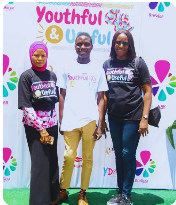
Winners of the YDOS 2024 SDG Innovation Challenge by 8th Gear Hub, Lagos, Nigeria

Yet, many face significant barriers like limited education, unemployment, healthcare access, and exclusion from decision-making hinder their full potential.