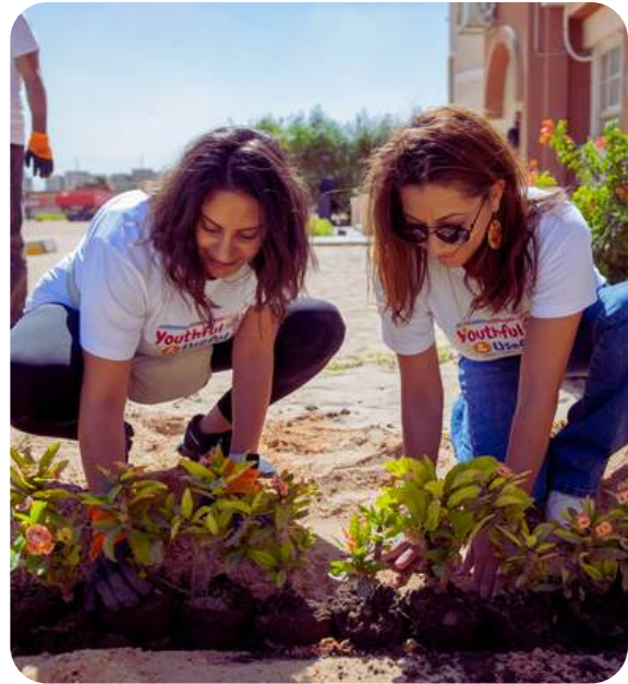
YDOS 2024 Volunteers in Egypt during Tree seedling planting project by INJAZ

YDOS is designed to ignite the agency and creativity of young people across Africa towards sustainable development.