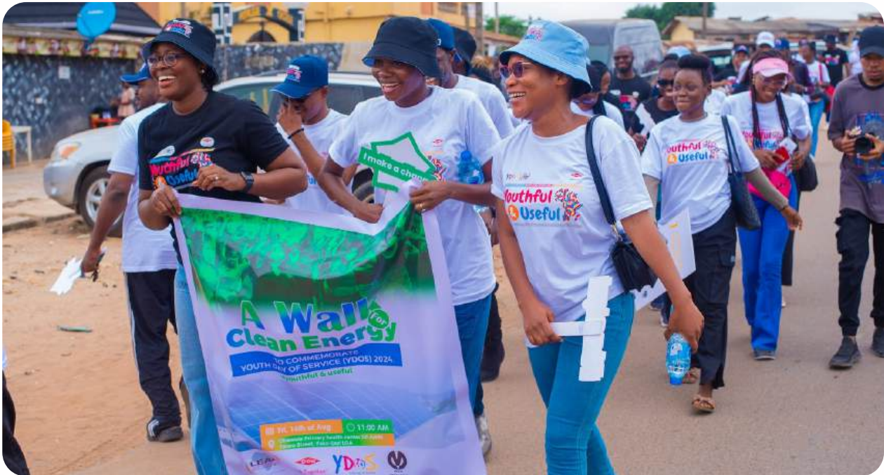
LEAP Africa team, Dow Nigeria Team, and Moon Innovations team during Walk to Advocate for Clean Energy