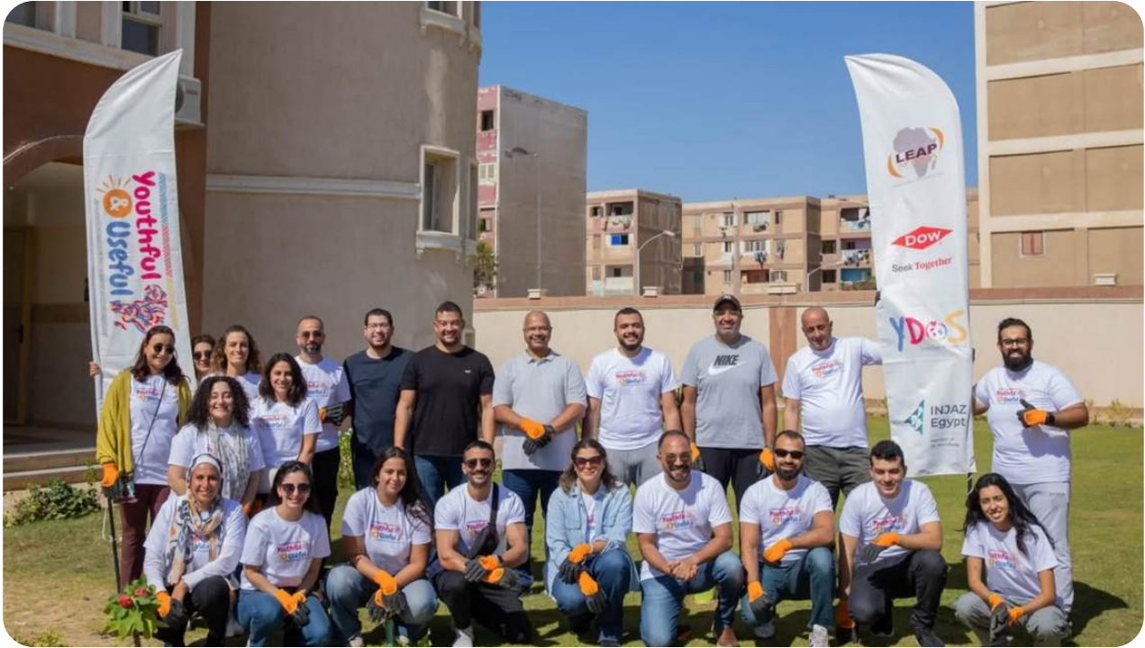
Dow Egypt Team representative, Injaz Team and Youth Volunteers during YDoS project in Egypt

On October 20, 2024, during a landmark collaboration between Fresh International School for Applied technology, Cairo, Dow Chemicals Egypt Employees and INJAZ, 34 volunteers and 12 students from the school were mobilized to plant 100 tree seedlings.