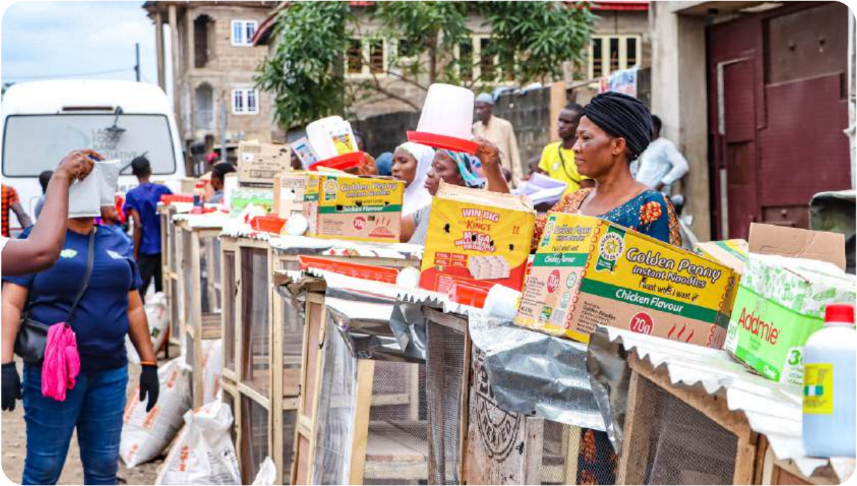
Poultry Farming items being presented to female beneficiaries by Lagos Food Bank Initiative