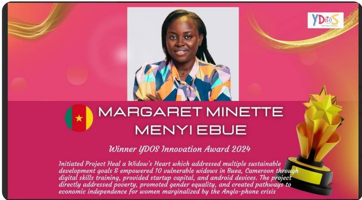
YDOS 2024 Innovation Award Winner - from Cameroon