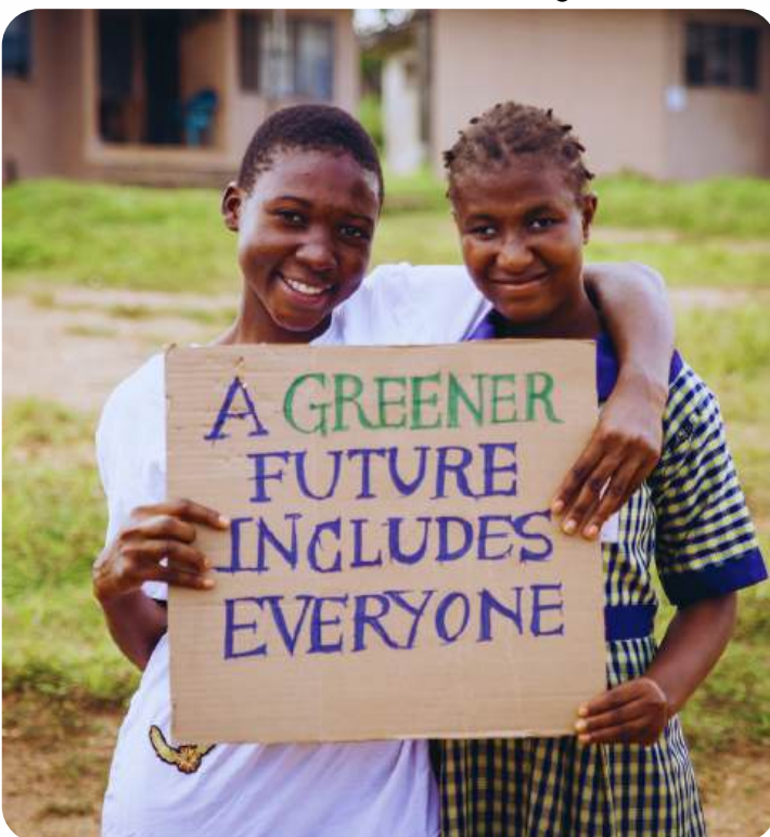
YDOS Project Beneficiaries at Ibadan, Nigeria during Climate Action Project

"I had a transformative experience volunteering as a Sign Language Interpreter for EcoSmart Club's pioneer Inclusive Climate Education Program, specifically designed for Hearing Impaired students who had previously been excluded from climate change education. EcoSmart Club recognised the gap in climate change education among hearing impaired students, and designed a project to empower the students with the knowledge and skills necessary to address climate change.