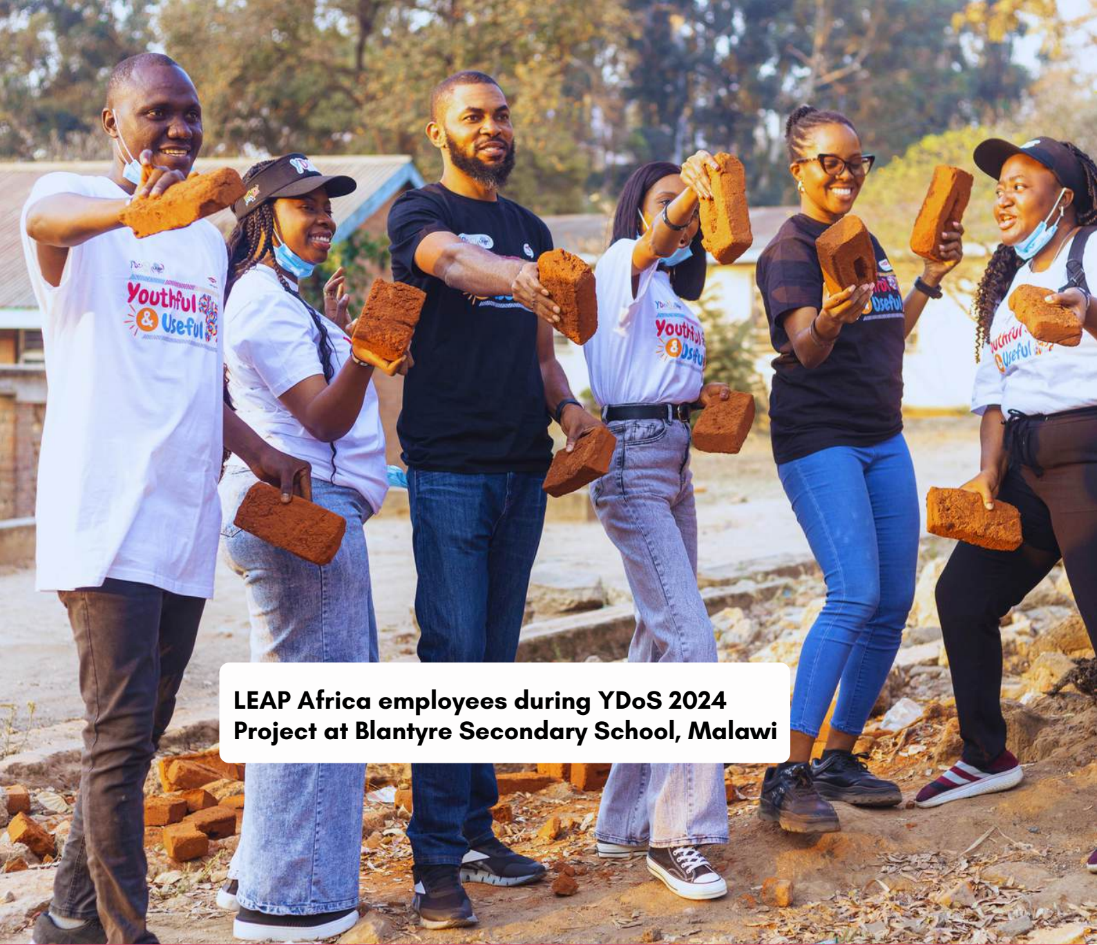
LEAP Africa employees during YDoS 2024 Project at Blantyre Secondary School, Malawi