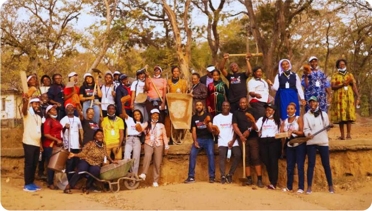
LEAP Africa Team with YDOS Volunteers during YDOS Project held at Blantyre Secondary School, Malawi