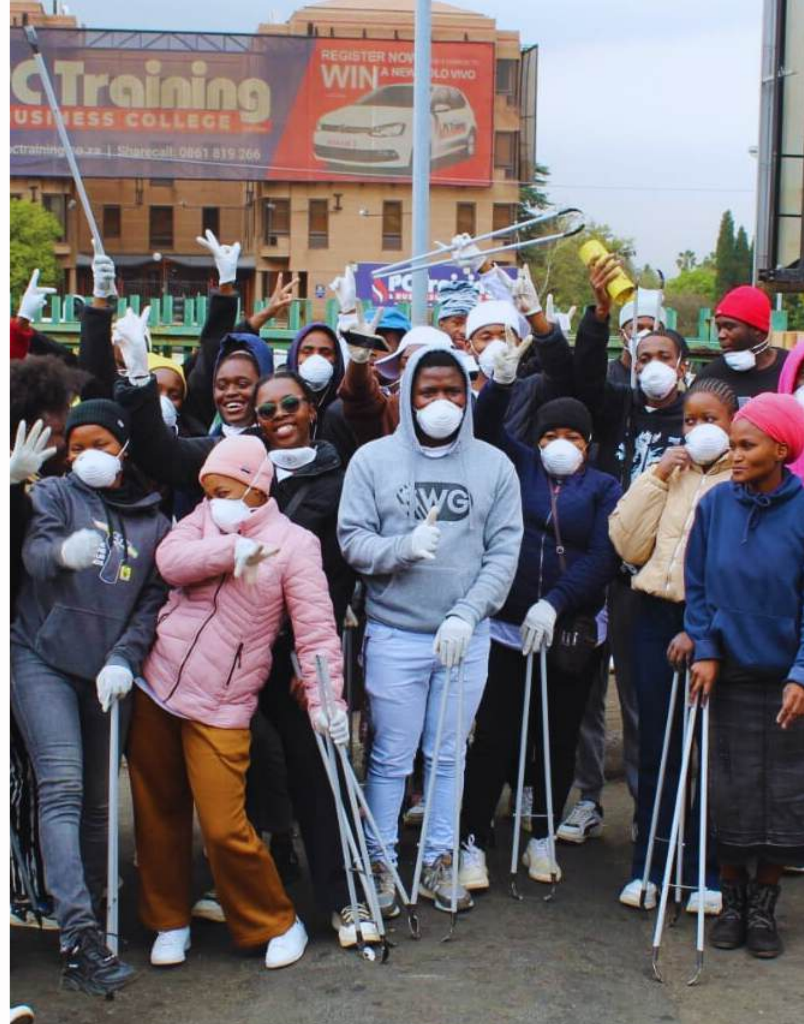
YDOS Volunteers during Clean-Up Exercise in Sandton led by Clean City SA