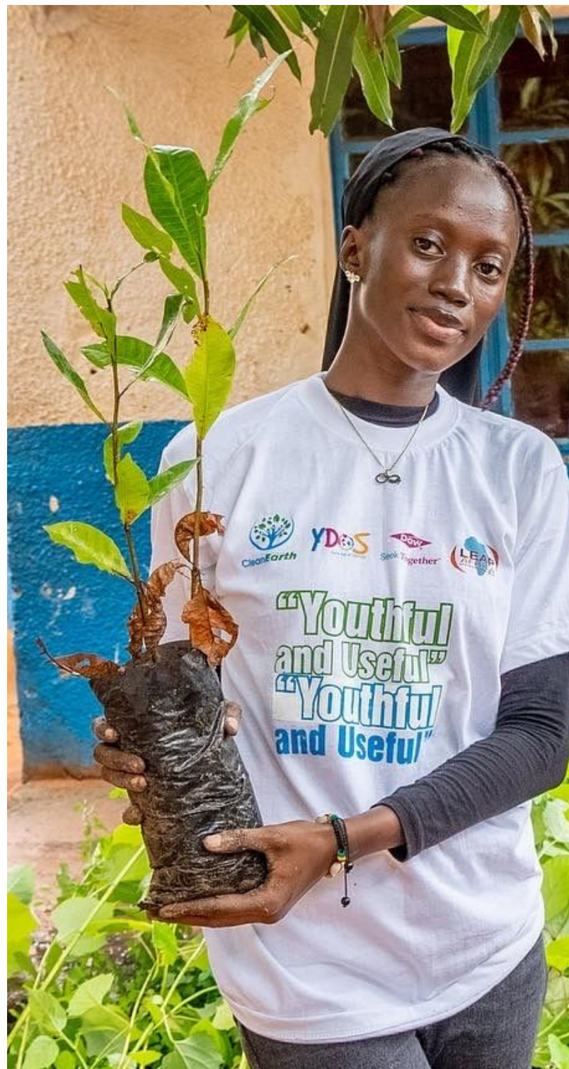
Photo: A YDOS 2022 volunteer during a tree planting exercise in Banjul, The Gambia

The youth of Africa are willing and ready to take actions towards attaining sustainable development in their communities. All hands must be on deck to support them in this journey.