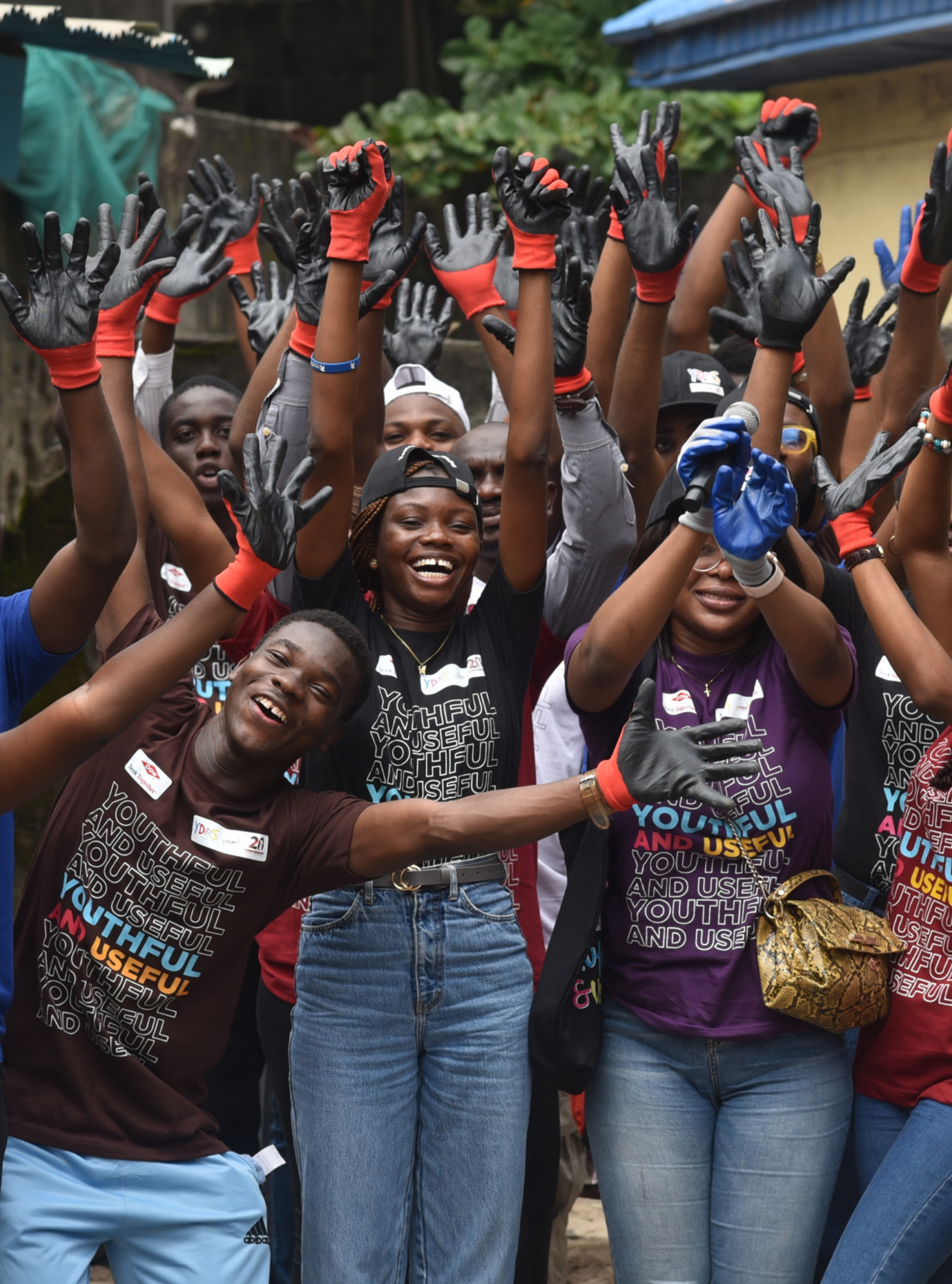
Photo: A group of YDOS volunteers at the 'Plant and Paint project' organised by LEAP Africa, in Lagos, Nigeria