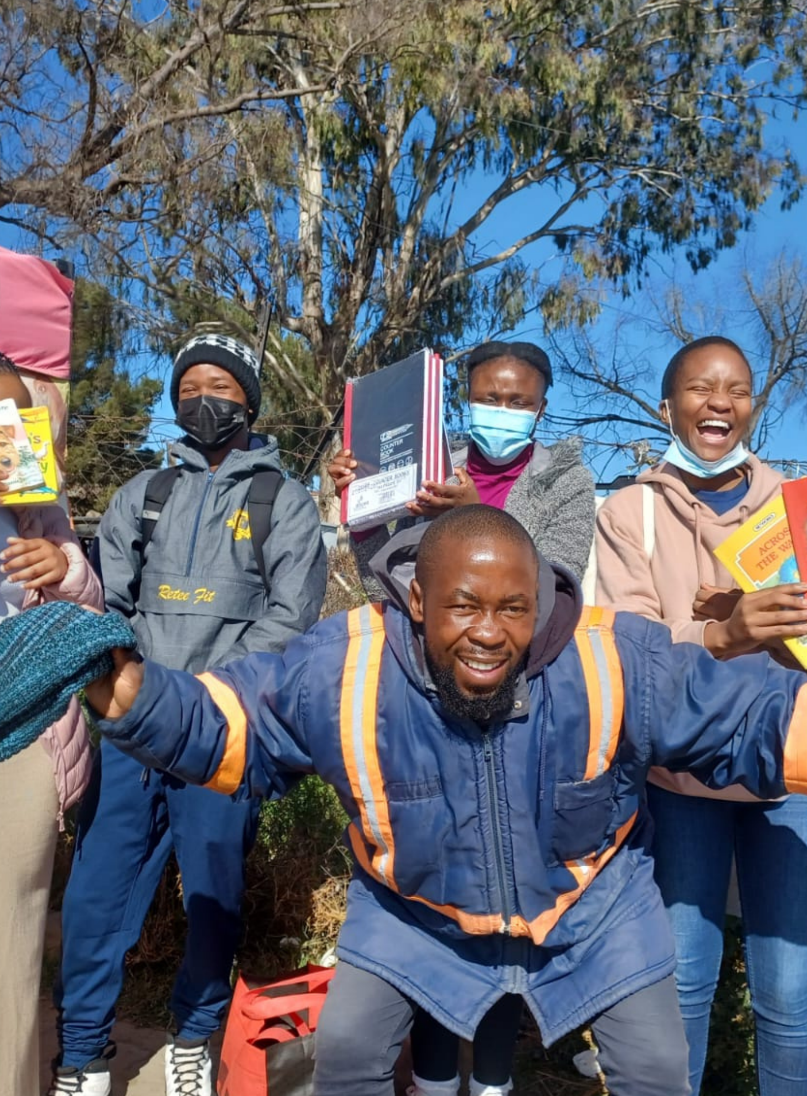
Photo : YDOS 2022 volunteers in Lesotho pose for a photo during the 'Between the Lines Project' - a book donation activity in, Maseru, Lesotho