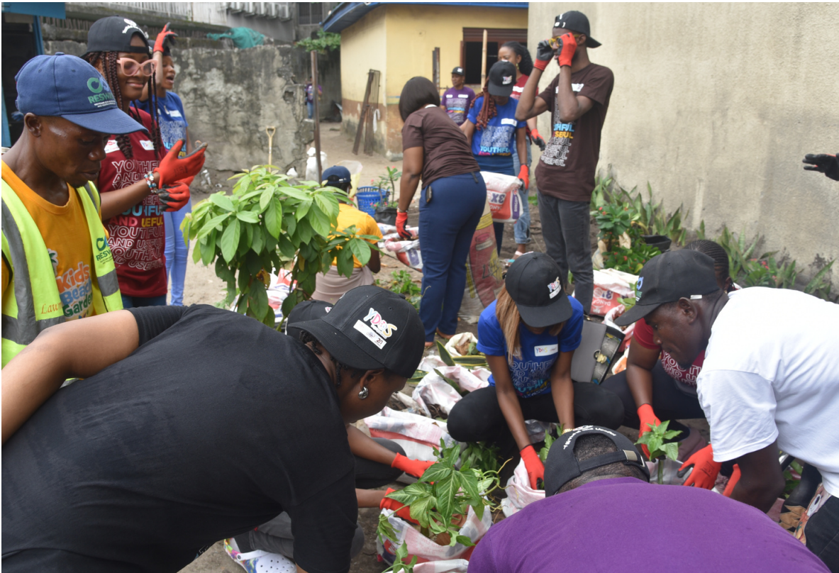
Photo: A group of YDOS volunteers at the 'Plant and Paint project' organised by LEAP Africa, in Lagos, Nigeria

The City of Lagos as other fast growing cities in the developing world is faced with the challenge of maintaining well kept spaces for wellness and recreation needed for relaxation. At Falomo High school, Lagos, the LEAP Africa team saw an opportunity to turn a large refuse dump-located close to the food market- into a beautiful tree and flower beautified food park. The motivation behind the project was to create a recreation space for students as well as to instill in them the art of gardening, thus encouraging them to reclaim abandoned spaces in their local communities to more healthy spaces.