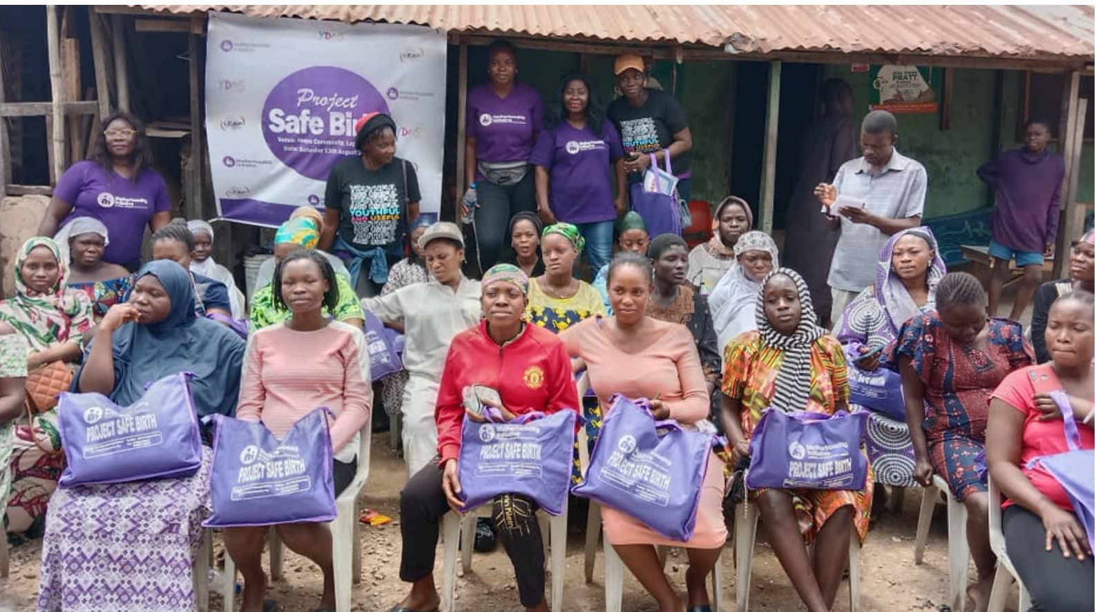
photo: Participants at the 'vocational training for Women project' in Lagos, Nigeria during YDOS 2022

The following key outputs were achieved from projects implemented by young people under the Goal 1 of the SDGs during the YDOS 2022