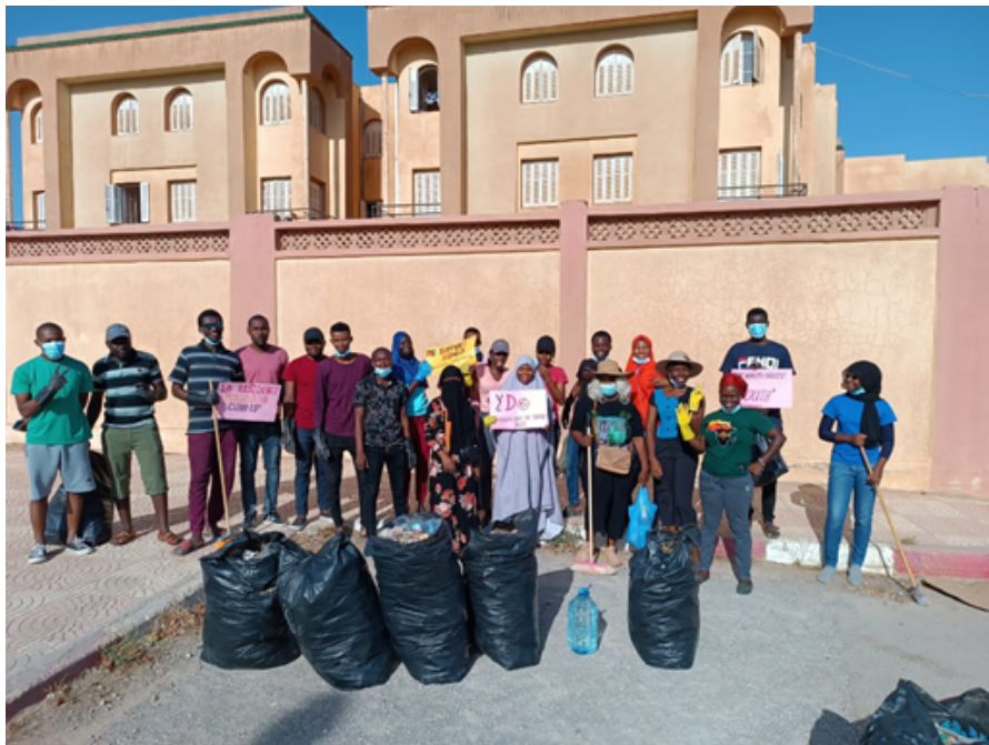
photo: A group of YDOS 2022 volunteers during a school clean up in Tlemcen Algeria