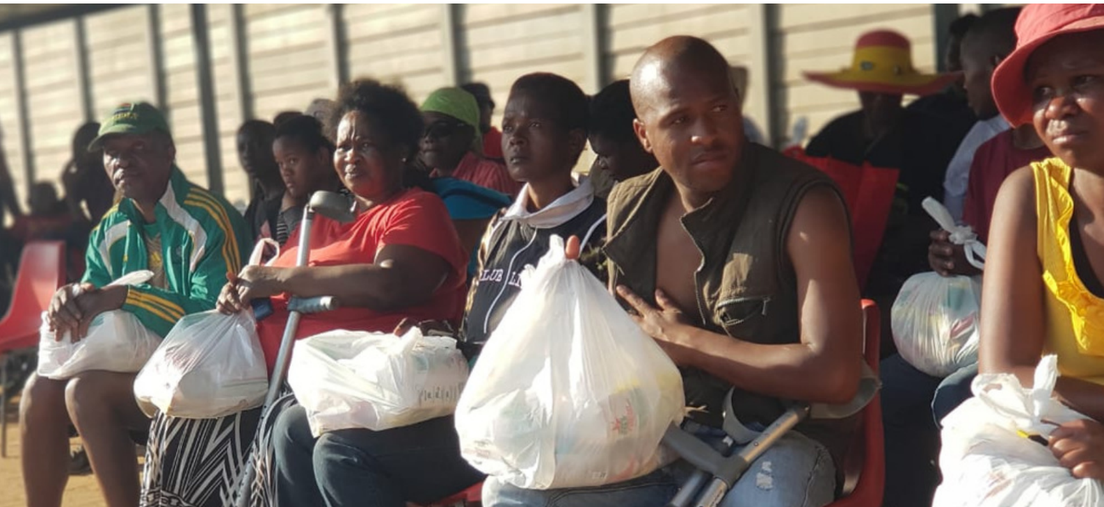
Photo : Individuals receiving food parcel during a food drive for Persons with Disability at Palmridge, South Africa during YDOS 2022

The following key outputs were achieved from projects implemented by young people under the Goal 10 of the SDGs during the YDOS 2022