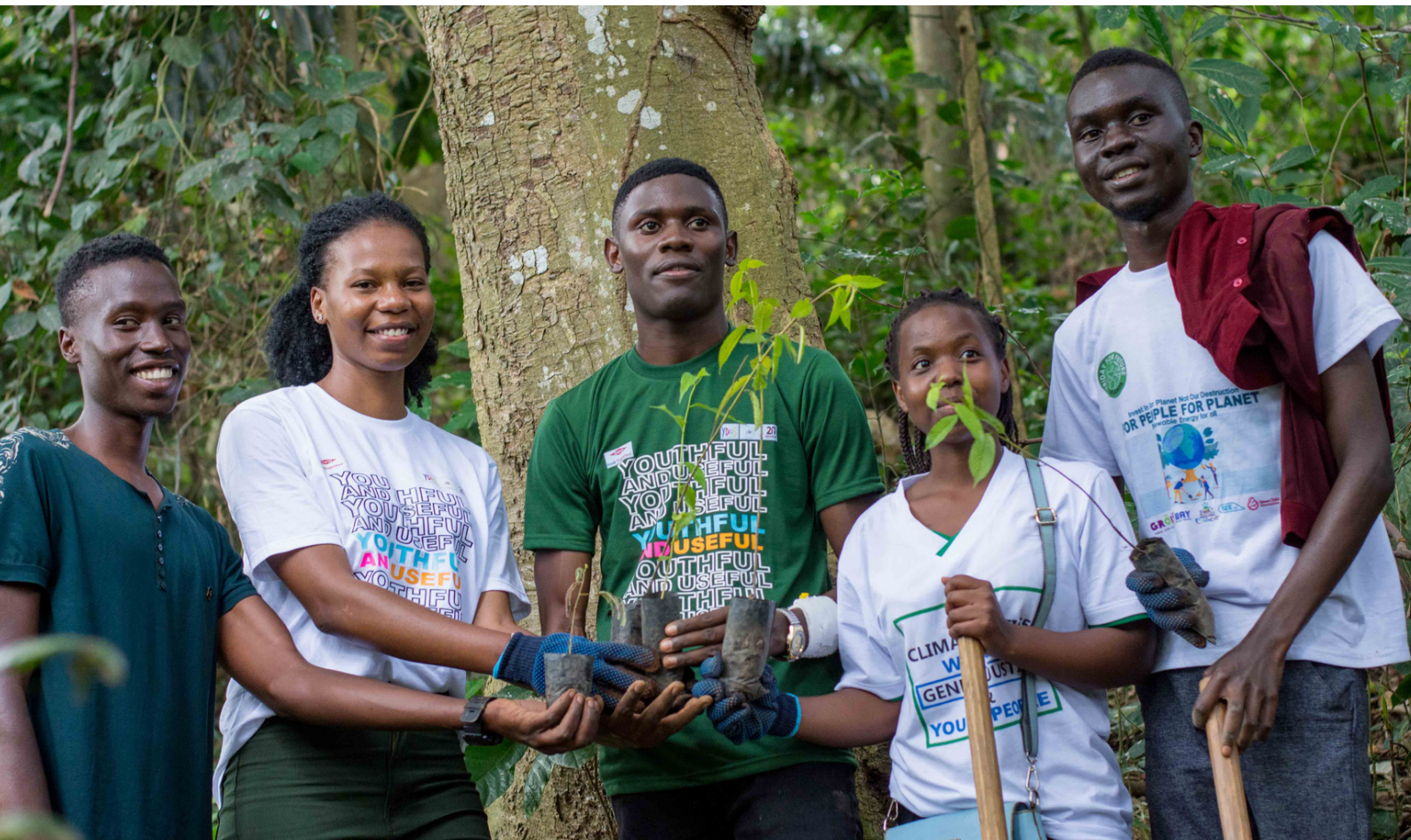
Photo : Volunteers at a tree planting project led by Green Futures Initiative - Uganda during YDOS 2022

The following key outputs were achieved from projects implemented by young people under the Goal 13 of the SDGs during the YDOS 2022