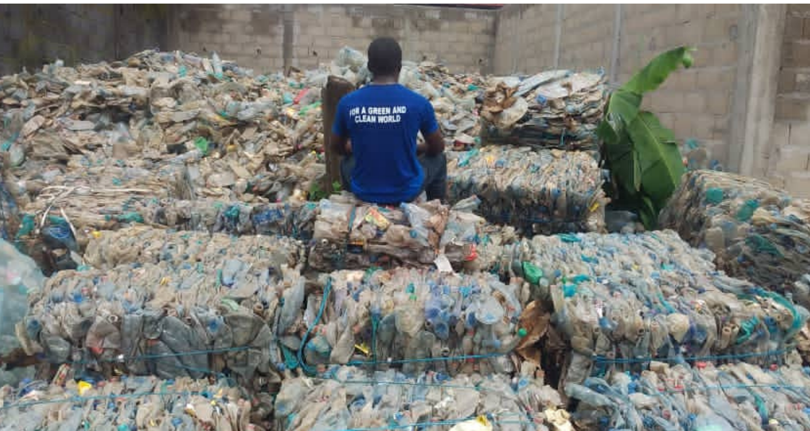
Photo : A volunteer seating on a heap of plastic collected from the streets of Douala, Cameroon during the 'cleanup Day project' during YDOS 2022

The following key outputs were achieved from projects implemented by young people under the Goal 11 of the SDGs during the YDOS 2022