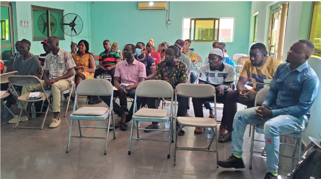
Photo : Participants at the 'Microenterprise project' at Nalerigu, Ghana during YDOS 2022