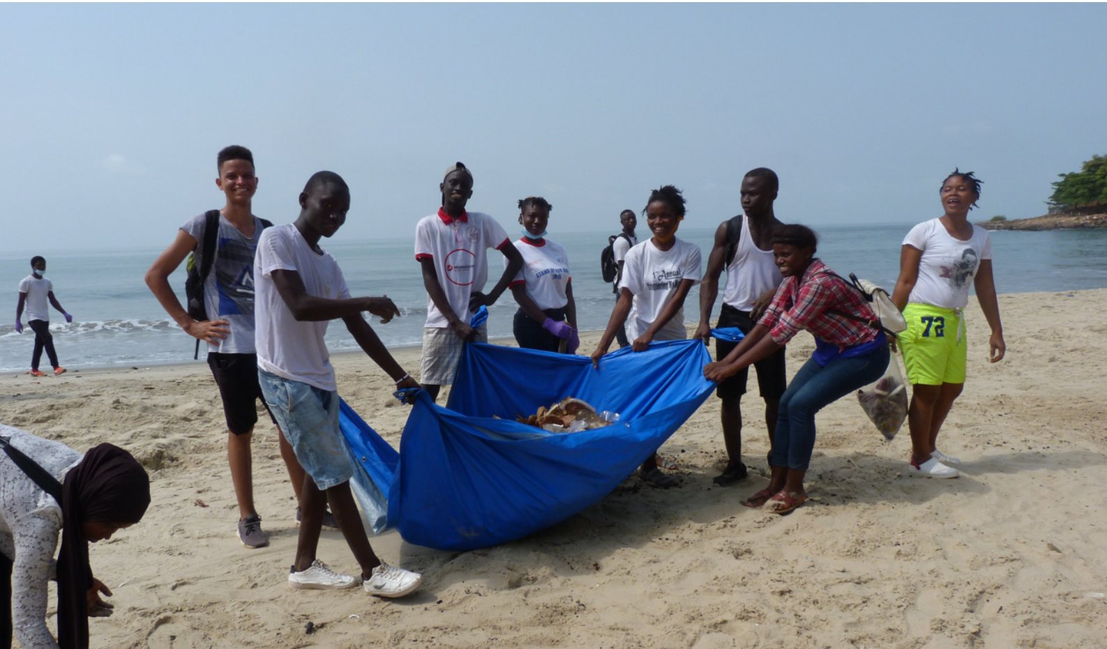
Photo : Volunteers at the 'Beach Clean Up Action project' at Lumelu Beach, Free town , Sierra Leone during YDOS 2022

The following key output was achieved from projects implemented by young people under the Goal 14 of the SDGs during the YDOS 2022