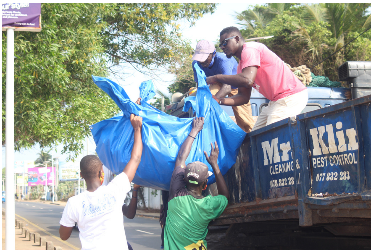
Photo : Volunteers at the 'Beach Clean Up Action project' at Lumelu Beach, Free town , Sierra Leone during YDOS 2022

The accumulation of non-biodegradable waste on land and water has negative impact on the environment. For one, it poses a health threat to residents in the communities as well as animals in surrounding water bodies. To address these threats a team of youth volunteers from the western area of Free town in Sierra Leone came up with an idea to carry out a clean up project at Lumley beach.