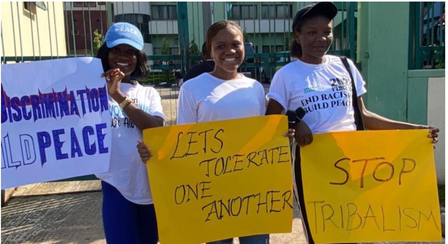
Photo : Volunteers at the Take a Walk Campaign in Abuja, Nigeria during YDOS 2022

The following key outputs have been achieved: