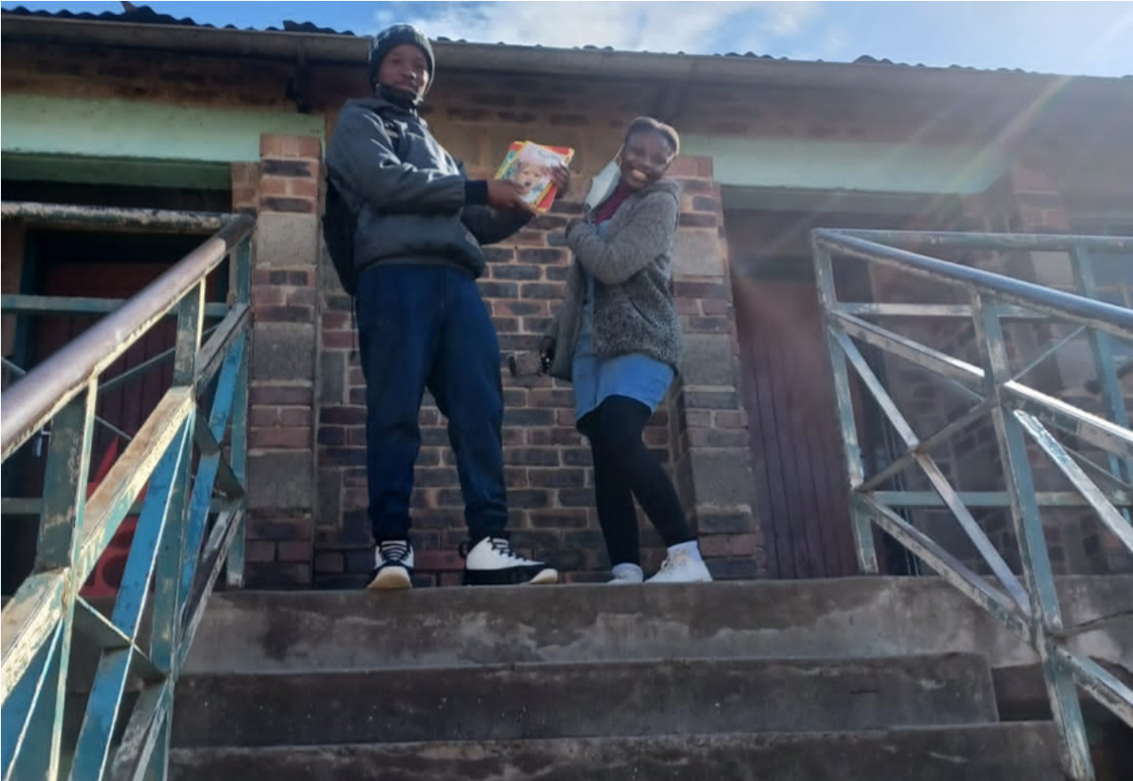
photo: Students pose with book received at the 'Between the Lines Literary project' in Maseru, Lesotho during YDOS 2022

Quality education is necessary for preparing young learners for successful transition into adult life. Success attained by learners in the early years of school prepare them for success at higher levels of learning and ultimately increase their chances of earning gainful employment. For a team of volunteers in Maseru, Lesotho, reading is essential for preparing learners for success. According to the leader of the group: