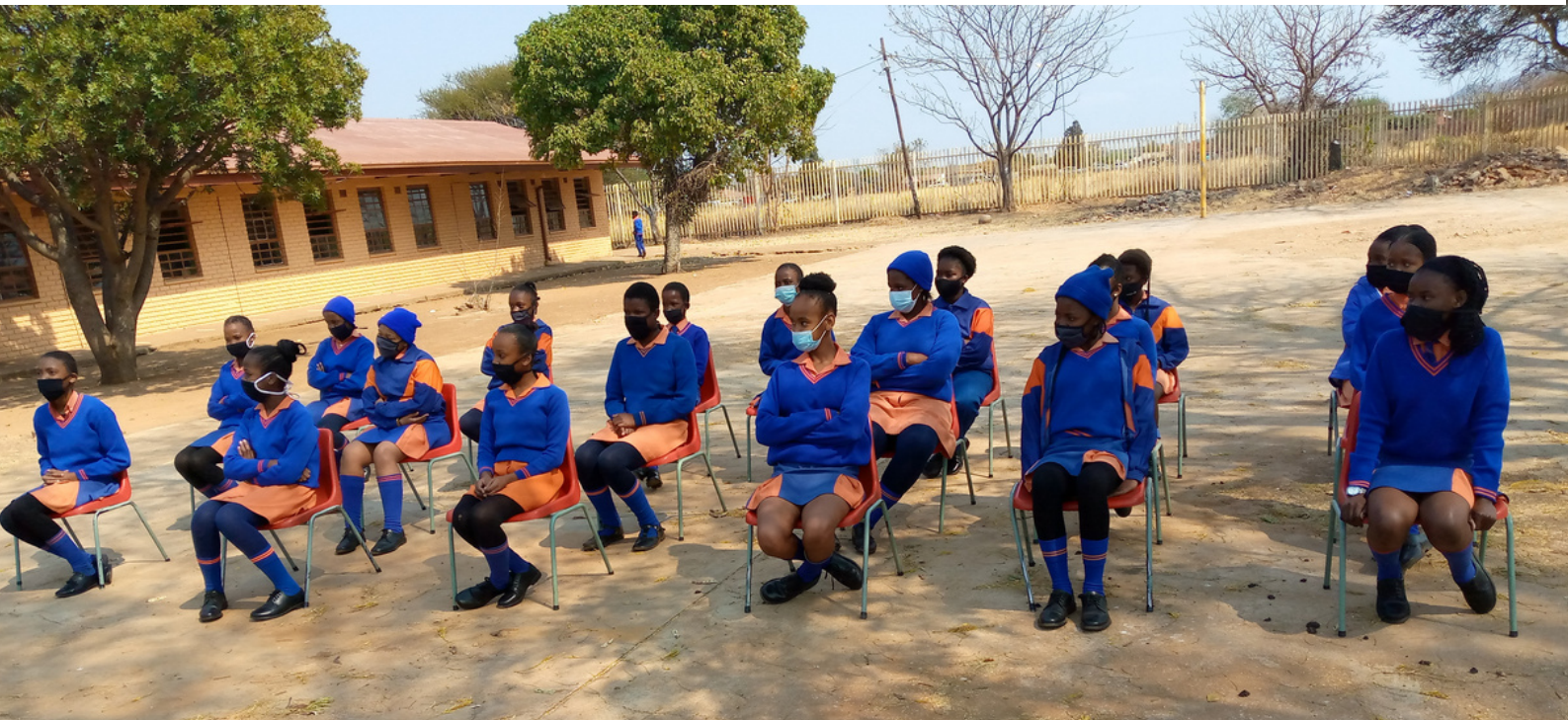
photo: A cross section of students at the 'For Youth by the Youth Project' in Pretoria, South Africa during YDOS 2022

The following key outputs were achieved from projects implemented by young people under the Goal 4 of the SDGs during the YDOS 2022