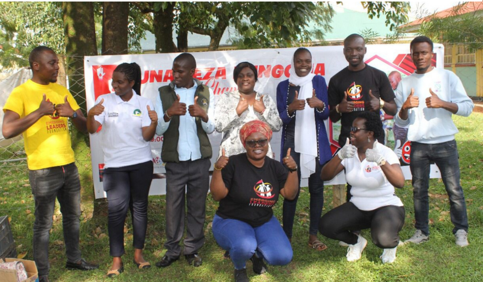
photo: A group of YDOS 2022 volunteers Led by Emerging Leaders Africa (ELF) at a blood donation exercise in Bungoma, Kenya

The following key outputs were achieved from projects implemented by young people under the Goal 3 of the SDGs during the YDOS 2022