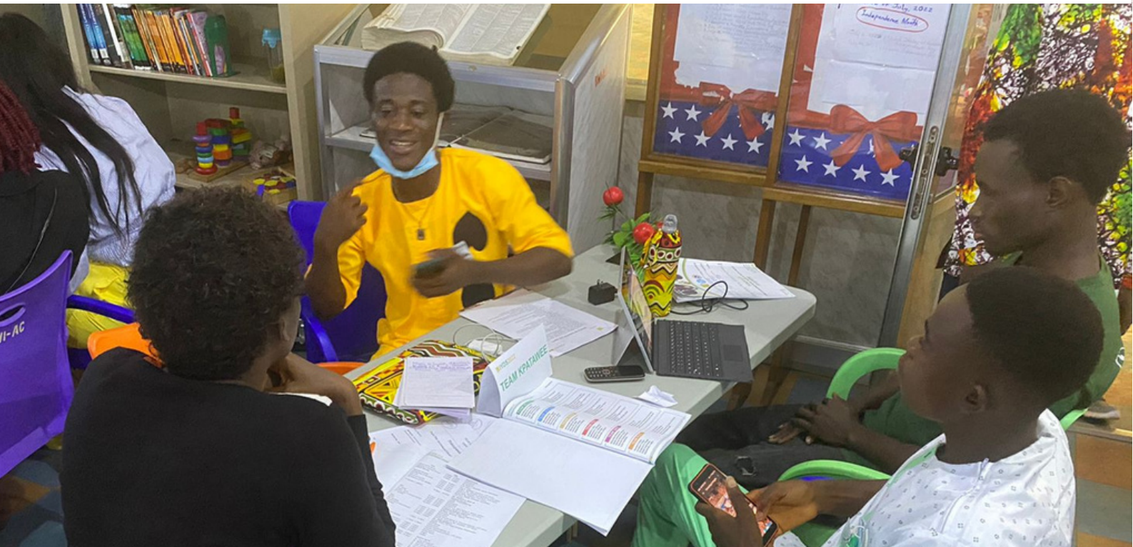
Photo : Participants sharing ideas at the International Youth Day Symposium in Kakata City , Liberia

The following key outputs have been achieved: