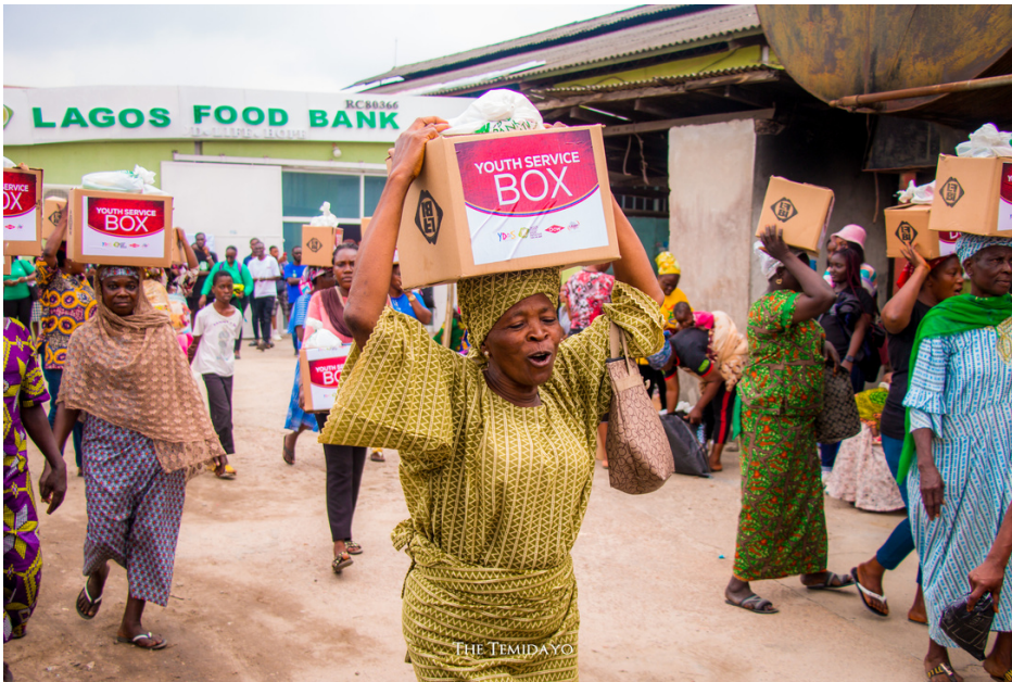
photo: A cross section of individuals carrying their food parcels at a Food drive in Lagos during YDOS 2022