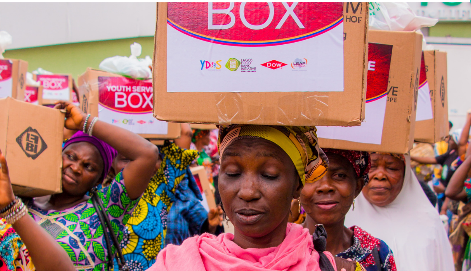
photo: A cross section of individuals carrying their food parcels at a Food drive in Lagos during YDOS 2022

The following key outputs were achieved from projects implemented by young people under the Goal 2 of the SDGs during the YDOS 2022