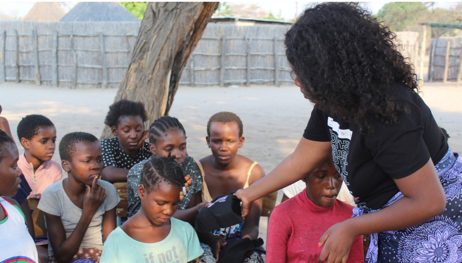
photo: A group of girls receiving clothings during the 'Zambezi girls project' in Zambezi, Namibia

The following key outputs were achieved from projects implemented by young people under the Goal 5 of the SDGs during the YDOS 2022