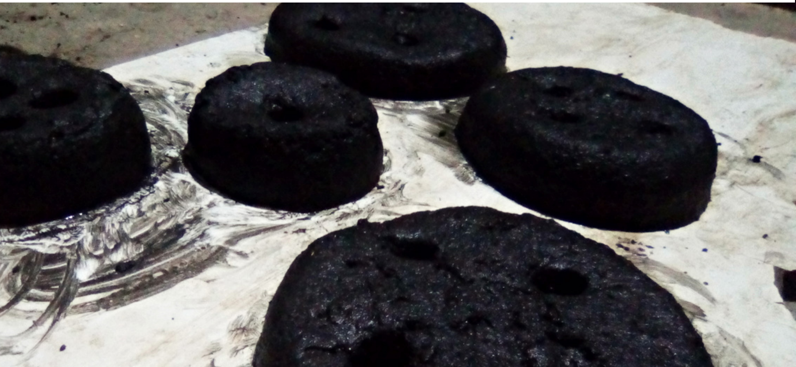
photo : Affordable charcoal briquettes produced at the 'charcoal briquettes production project' in Lusaka, Zambia during YDOS 2022

The following key outputs were achieved from projects implemented by young people under the Goal 7 of the SDGs during the YDOS 2022