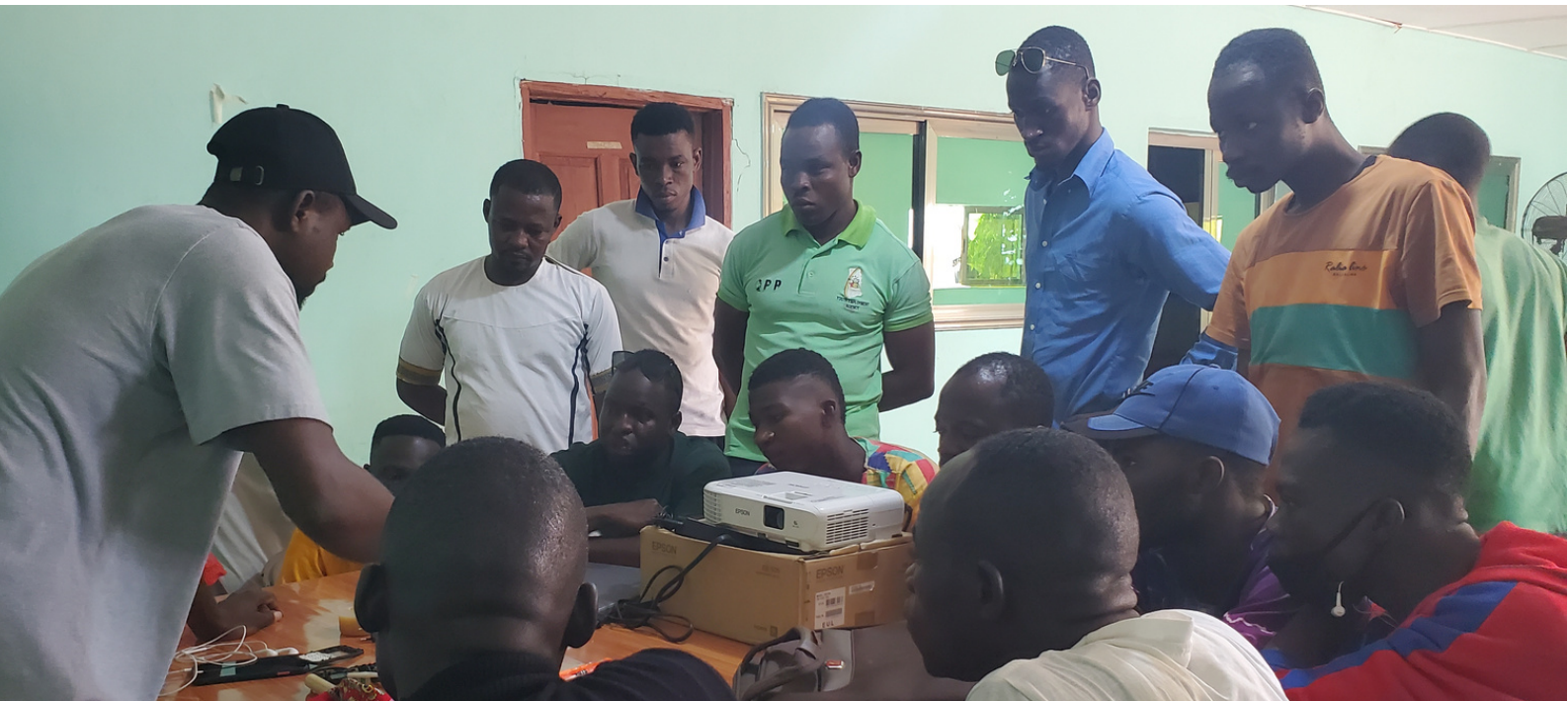
Photo : Participants at the 'Microenterprise project' implemented at Nalerigu, Ghana during YDOS 2022

The following key outputs were achieved from projects implemented by young people under the Goal 8 of the SDGs during the YDOS 2022