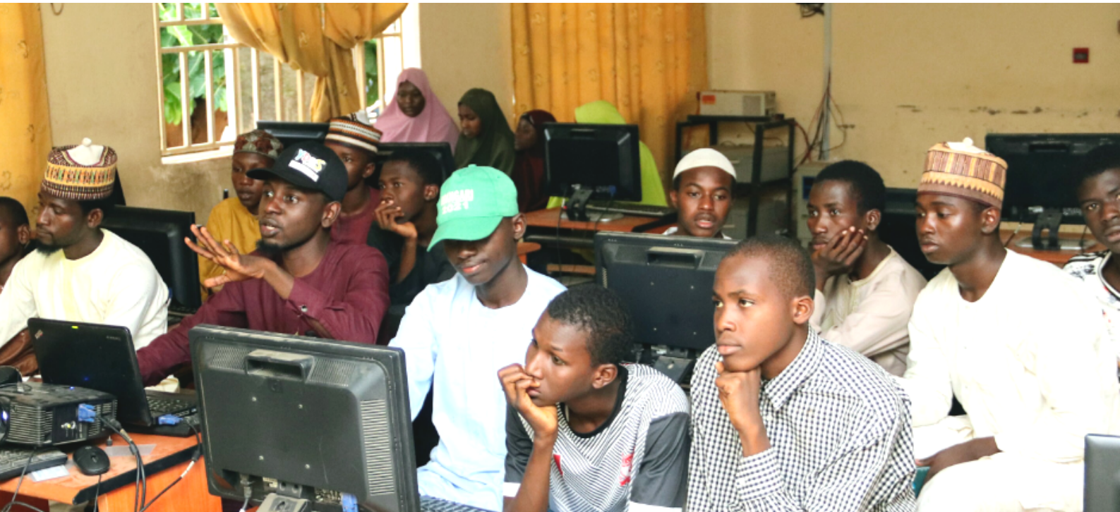
Photo : Participants at the 'Sarakee Skills Aquisition Training for Women and Youth project' in Gombe Nigeria during YDOS 2022

The following key output was achieved under the Goal 9 of the SDGs during the YDOS 2022