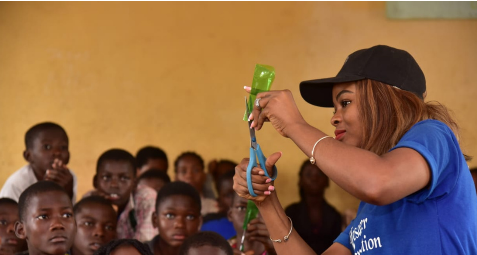
Photo : Children at Upcycling bottles project at Magboro , Ogun state, Nigeria during YDOS 2022

The following key outputs were achieved from projects implemented by young people under the Goal 12 of the SDGs during the YDOS 2022