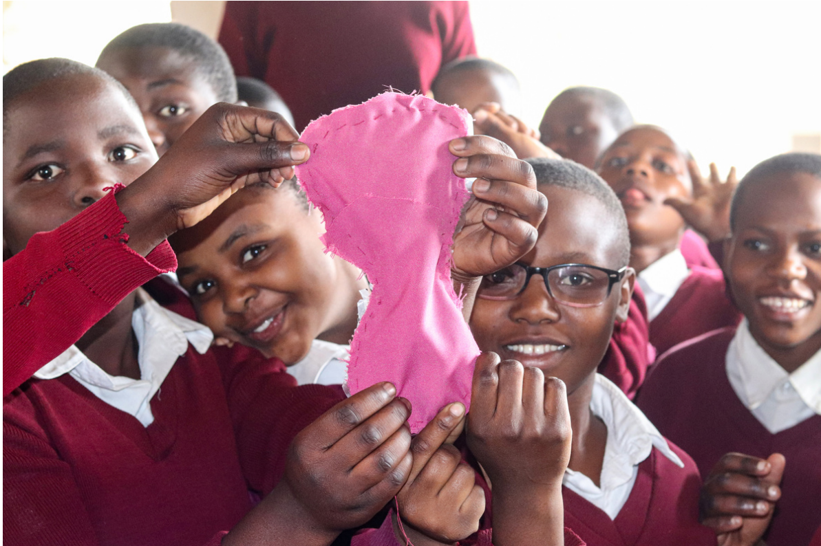
Photo: Female students learning how to make sanitary pads at the 'Sanitary Pads Village' project in Tanzania